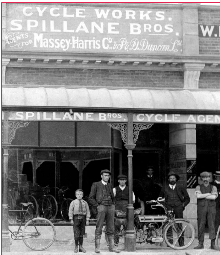
Spillane Bros Temuka in 1909

It is our Turangawaewae, and we thank our forebears for having the foresight to put down their roots in such a stunning area.