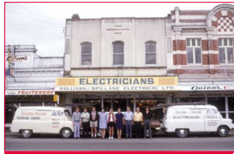
Sullivan & Spillane Electrical Temuka in 1973.